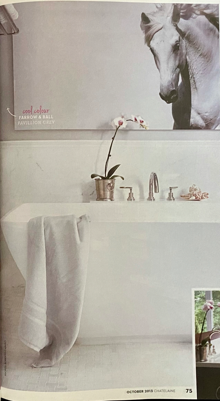
COOL COLOUR FARROW & BALL PAVILLION GREY

BATHTUB, FAUCETS, GINGERS, COM. TILE, SALTILLO-TILES.CA. COUNTERS, CRYSTALMARBLE.COM. HARDWARE, UC5H.COM. ART, ELTE.COM. PAINT, $110/GAL., FARROWANDBALL.COM.